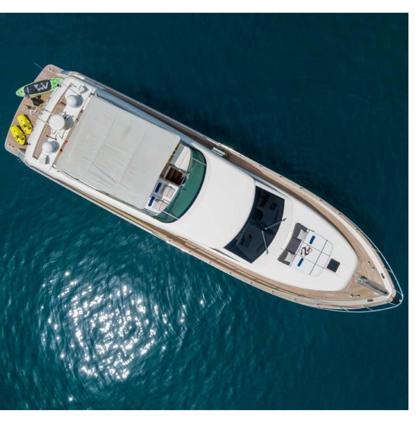
Blue Ice is a stunning Uniesse 72, entirely refitted in 2016. Its 22,4-meter length offers the spaces and comfort of a much larger boat. The hull typology allows for great stability both during sailing and at anchor, while the two engines ensure limited consumption.

The yacht boasts four cabins: Master, VIP and two Twin all with bathroom and SAT-TV. The large salon area has a large sofa with 40" Sat-TV and a table that seats up to eight guests. The comfortable table for eight is located at stern. The flybridge has a sunbathing area and a table with chairs.